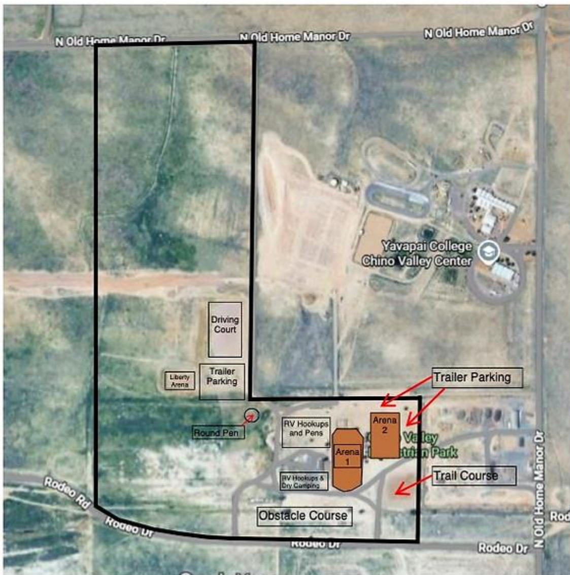
Chino Valley Equestrian Park